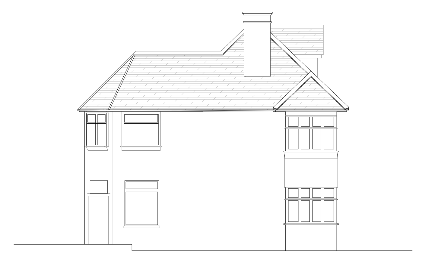
Existing East Elevation