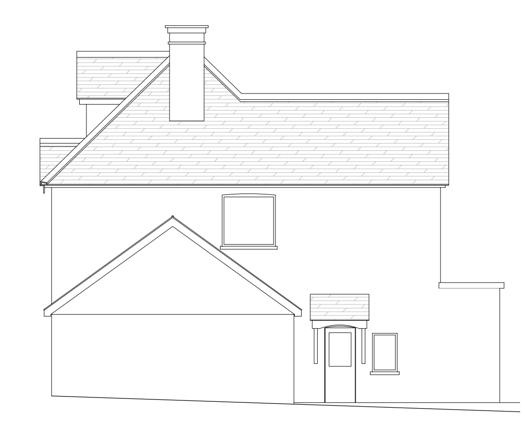
Existing West Elevation